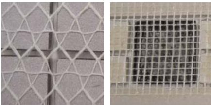
Examples of meshed backed mosaics.

prior to application, it is important to note the difference between the two: Meshed Backed Mosaics are: • easy to apply • need no additional work once placed • a mesh covers the back of the tile • the adhesive used to fix the mesh backing can be water sensitive.